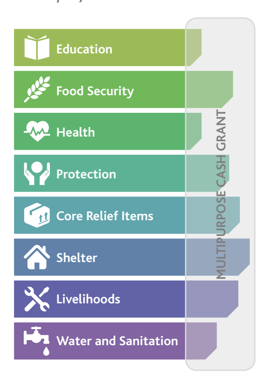
FIGURE 3. MEB and MPG as foundation for sector-specific interventions

The MEB should not be confused with the MPG transfer value. The MEB is fixed for a given emergency unless there are significant changes in prices or needs. In contrast, the MPG transfer value may change based on the availability (value and coverage) of other humanitarian assistance, such as government interventions, the targeting strategy and criteria (e.g. wider coverage with a reduced grant versus targeted coverage with a bigger grant), or the programme objective (e.g. livelihoods recovery) and any additional cash requirements households may have. See MPG Transfer Design for more detail.